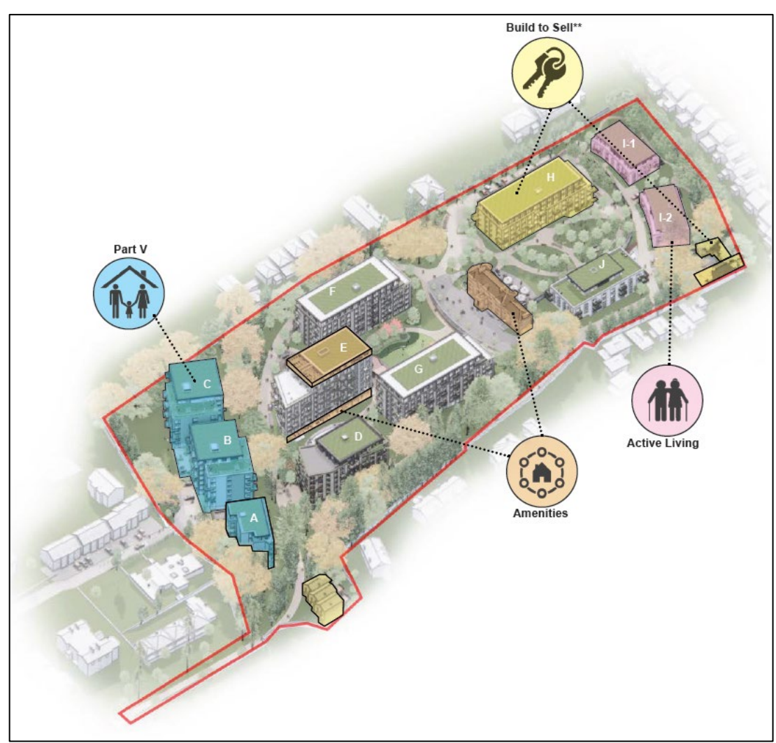
Figure 2.1.1: Mix of Uses across the site, including location of potential Build to Sell units, Active Living, Part V, Residential Amenities.